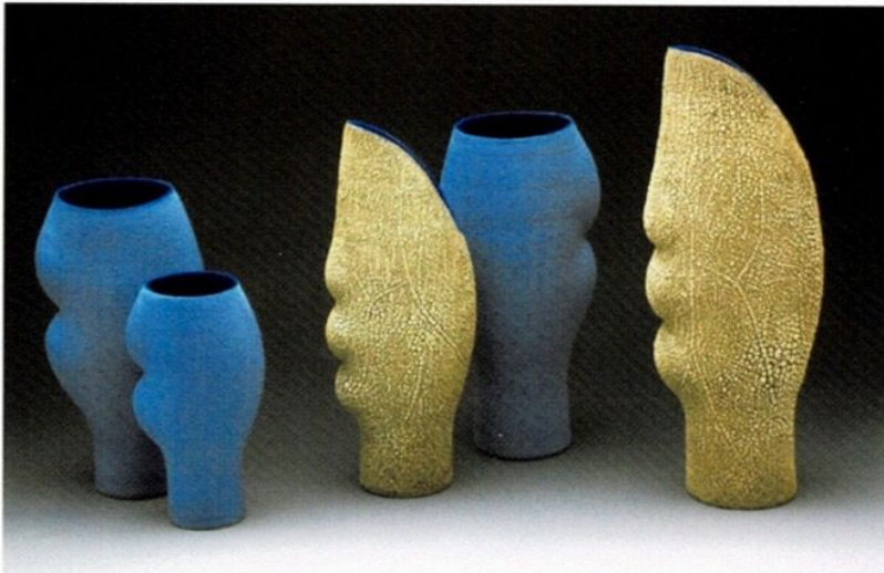
Body-Vessels / Vessel-Bodies , various dimensions, H: 18 - 39 cm, 1999